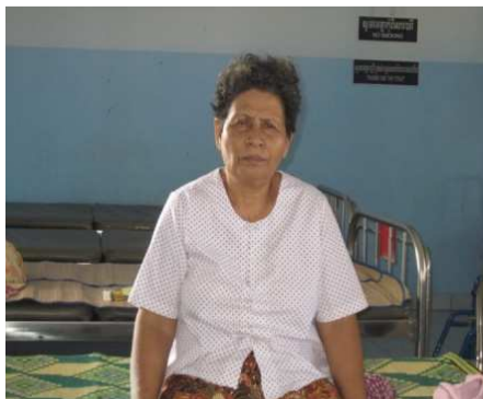
Walks without assistance